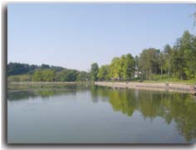
The lower lake at Twin Lakes Park.

Identifying viable alternatives was a challenge, given the difficult topography and thin soils that defined the site where the treatment system needed to be constructed. Site conditions did not allow for a conventional onsite septic system. And the park is used every summer for the Westmoreland Arts and Heritage