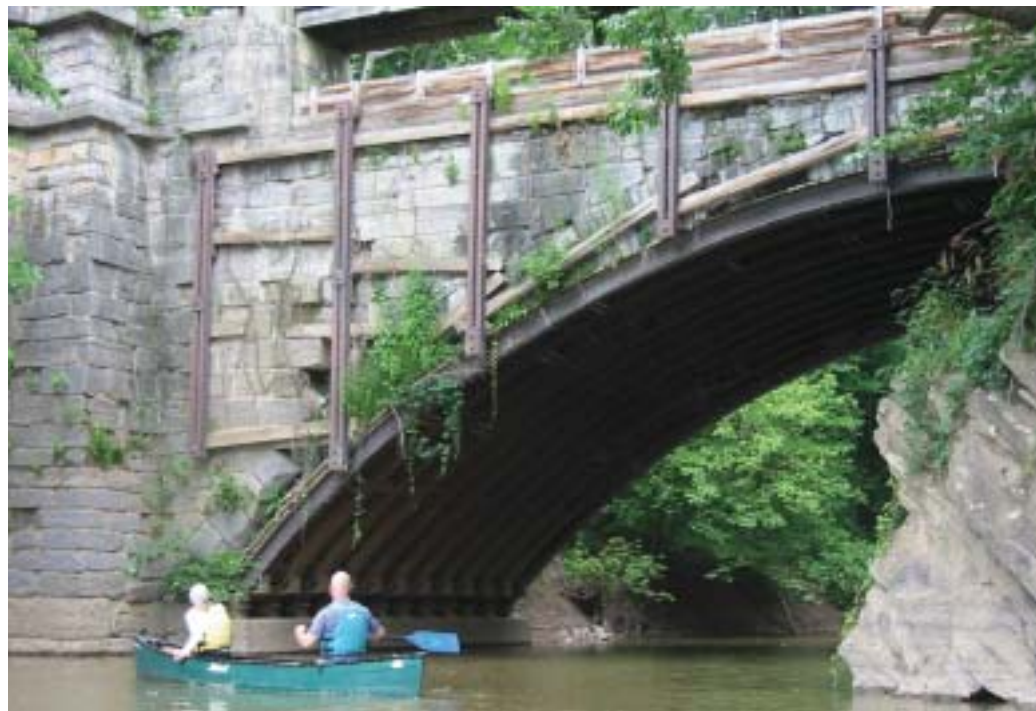
Canoeists paddle under Tonoloway Creek Aqueduct, near Hancock, Md., for a closer look."