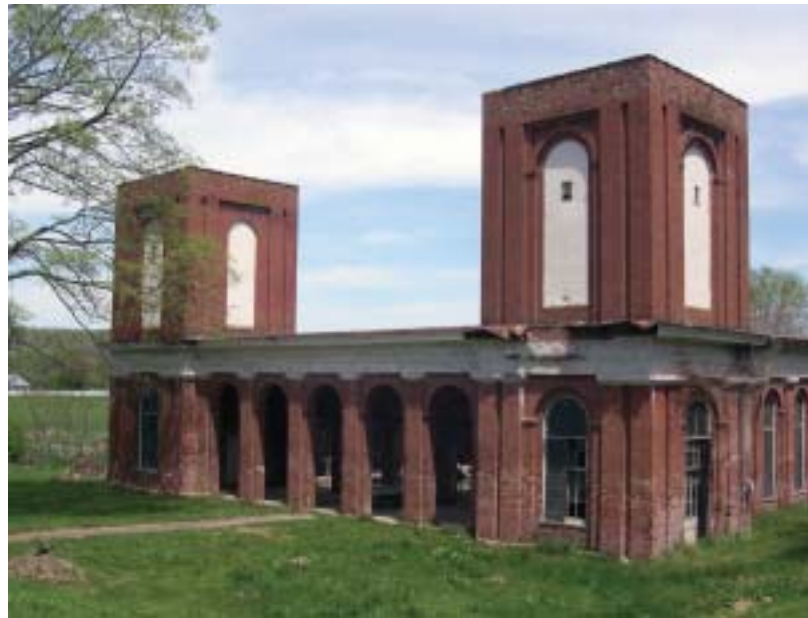
The bathhouse at the Sweet Springs Resort in Monroe County. The resort drew vacationers in the 18th and 19th centuries and is listed on the National Register for Historic Places.