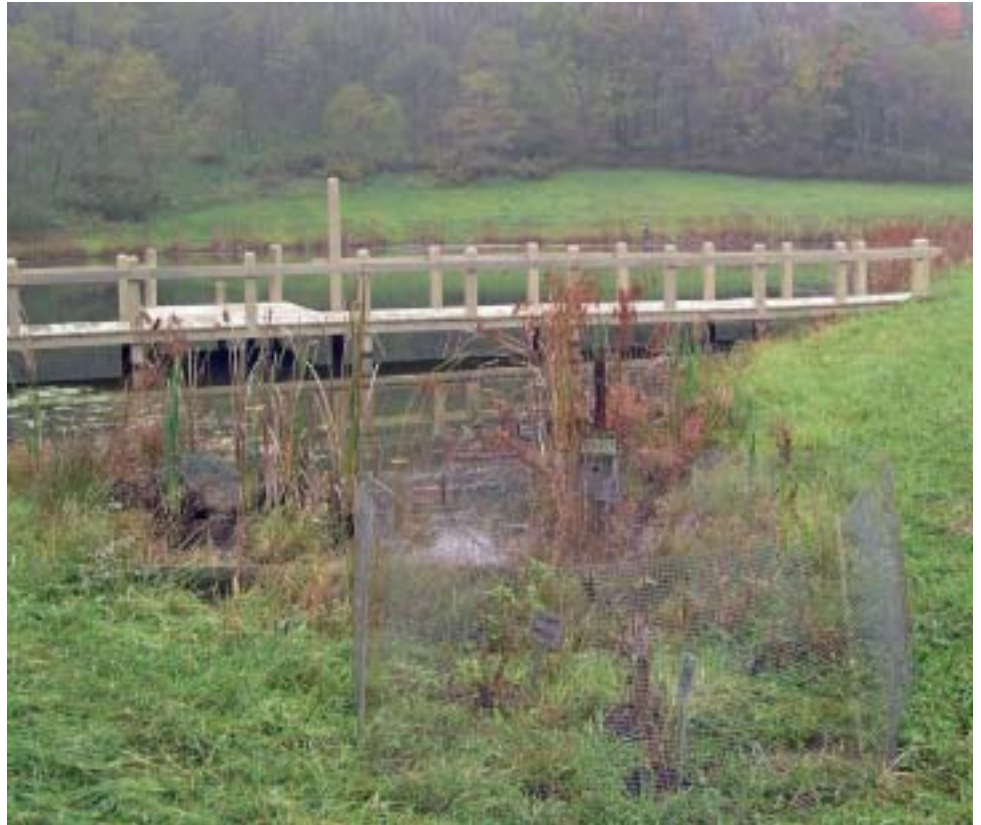
The environmental education and observation area at Sweet Soil. Native vegetation inside the chicken wire was recently planted by several students.

The site for the workshops was the property of Sweet Soil, Inc., a for-profit business with a very strong environmental stewardship ethic. Sweet Soil purchased a 276-acre strip mine site with the intent to prove degraded land can be reclaimed to support many beneficial activities. To accomplish this, Sweet Soil incorporated an alkaline co-product along with other organic waste into the spoil of the mined site. Paper