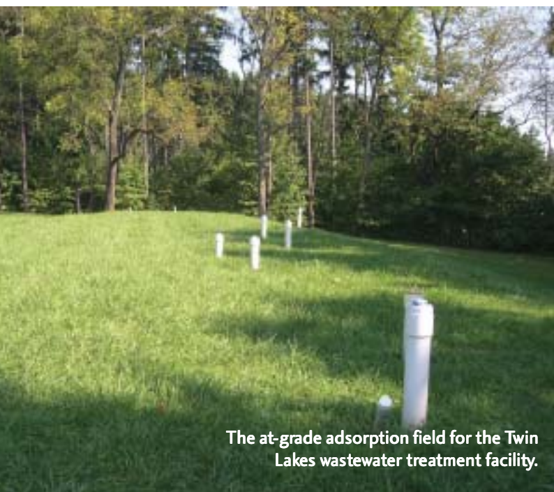
The at-grade adsorption field for the Twin Lakes wastewater treatment facility.

This successful demonstration project required close cooperation among local citizens, township boards, state and local agencies and nonprofit organizations. The project is demonstrating how incorporating a peat-based filter into the design would allow for alternative systems to be installed in many rural areas of the Mid-Atlantic Highlands where soils are unsuitable for conventional septic systems.